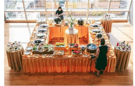
Breakfast restaurant Opening: 06.00-10.00 hrs.