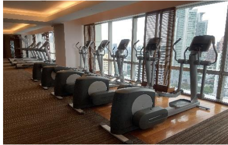
Fitness Center on 25 th Floor Opening: 05.00-22.00 hrs.