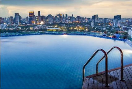
Swimming pool on 25 th Floor Opening: 06.00-20.00 hrs.